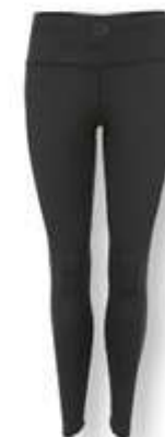
FUNCTIONALS 7/8 TIGHTS LADIES II ART. NO. 434609 - 8000