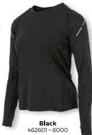
Black 462601 - 8000