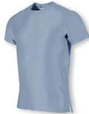
Mountain Spring 414004 - 5552