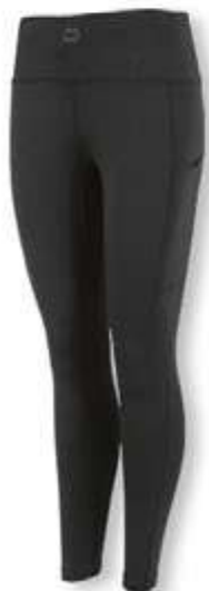
Black 434609 - 8000