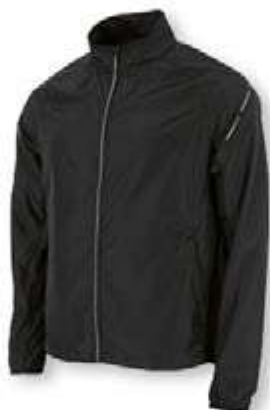
Black 457004 - 8000