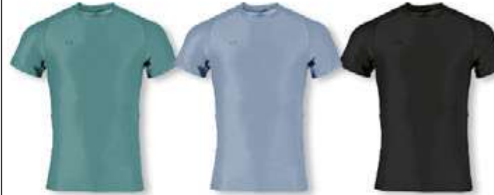
1150 5552 8000 FUNCTIONALS TRAINING TEE ART. NO. 414004