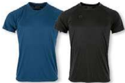
7555 8000 FUNCTIONALS TRAINING TEE II ART. NO. 414015