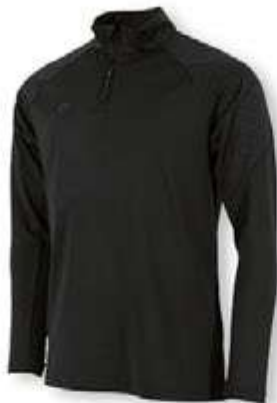
Black - Anthracite 408030 - 8900