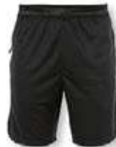
FUNCTIONALS SHORTS II ART. NO. 422003 - 8000