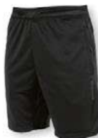
Black 422003 - 8000