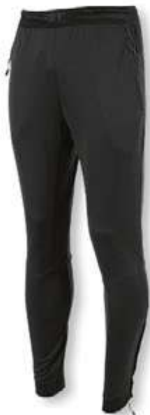
Black 432008 - 8000