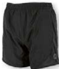
Black 437601 - 8000