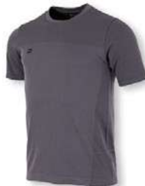
Anthracite - Black 414013 - 9980