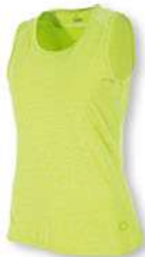
Lime 469601 - 1740