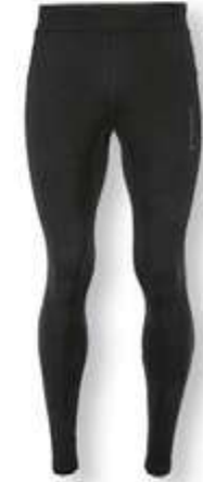
FUNCTIONALS TIGHTS ART. NO. 434005 - 8000