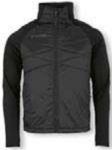
FUNCTIONALS THERMAL TOP ART. NO. 408022 - 8000