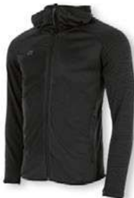
Black - Anthracite 408028 - 8900