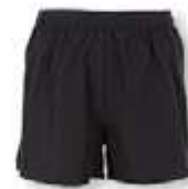
FUNCTIONALS 2-IN-1 SHORTS LADIES ART. NO. 422600 - 8000