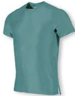
Ocean Green 414004 - 1150