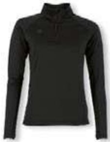
FUNCTIONALS 1/4 ZIP TOP LADIES II ART. NO. 408611 - 8900