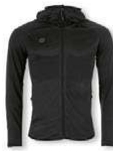
FUNCTIONALS HOODED FULL ZIP TOP II ART. NO. 408028 - 8900