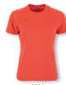
6620 8000 FUNCTIONALS TRAINING TEE LADIES ART. NO. 414603