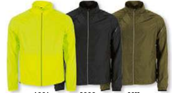
4004 8000 9911 FUNCTIONALS RUNNING JACKET ART. NO. 457004