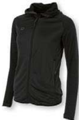
Black - Anthracite 408610 - 8900