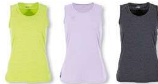
1740 7090 9990 FUNCTIONALS WORKOUT TANK TOP LADIES ART. NO. 469601