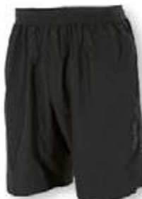
Black 422002 - 8000