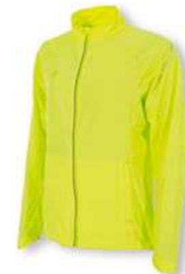
Neon Yellow 457600 - 4004