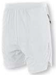
White 437003 - 2000