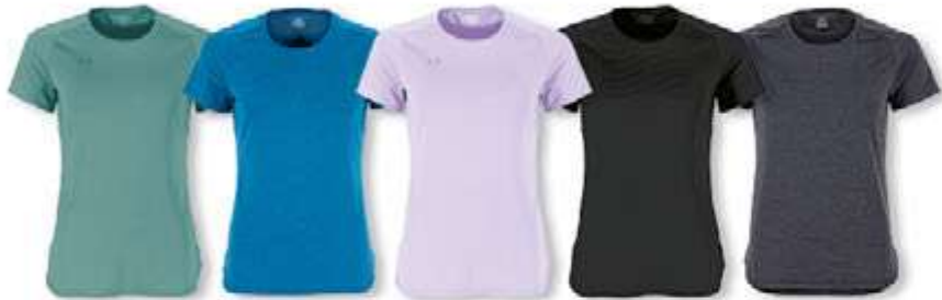
1150 5555 7090 8000 9990 FUNCTIONALS WORKOUT TEE LADIES ART. NO. 414600