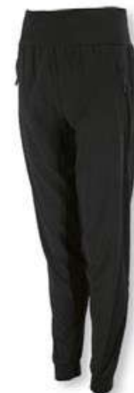
Black 431601 - 8000