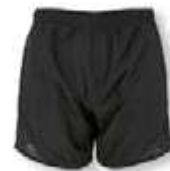
FUNCTIONALS AERO SHORTS LADIES ART. NO. 437601 - 8000