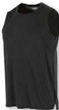
Black 469000 - 8000