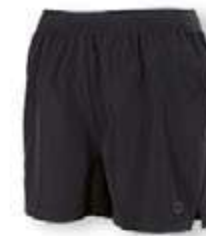
Black 422600 - 8000