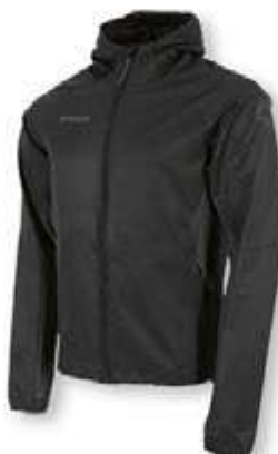
Black - Anthracite 457002 - 8900