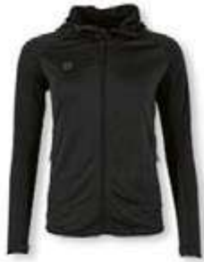
FUNCTIONALS HOODED FULL ZIP TOP LADIES II ART. NO. 408610 - 8900