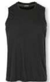
FUNCTIONALS LIGHTWEIGHT TANK TOP ART. NO. 469000 - 8000