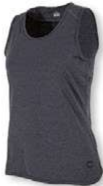
Anthracite 469601 - 9990