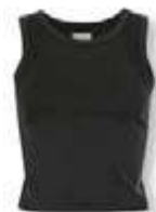
FUNCTIONALS 2-IN-1 TOP LADIES ART. NO. 469603 - 8000