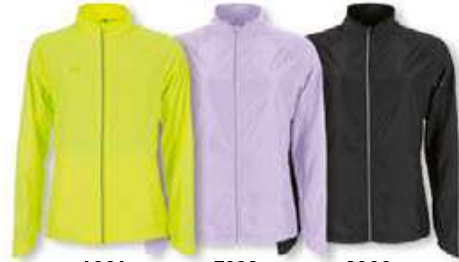
4004 7090 8000 FUNCTIONALS RUNNING JACKET LADIES ART. NO. 457600