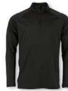
FUNCTIONALS 1/4 ZIP TOP II ART. NO. 408030 - 8900