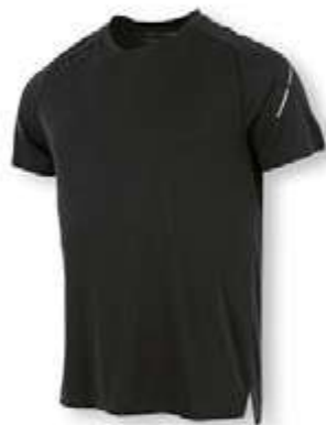
Black 414011 - 8000