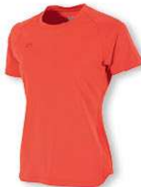
Coral 414603 - 6620