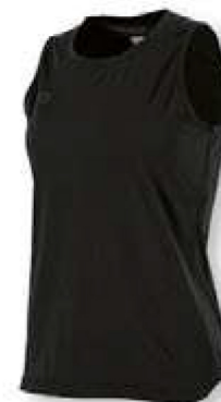
Black 469604 - 8000