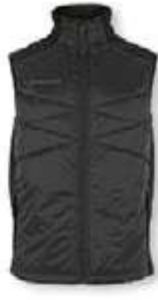
FUNCTIONALS THERMAL VEST ART. NO. 467000 - 8000