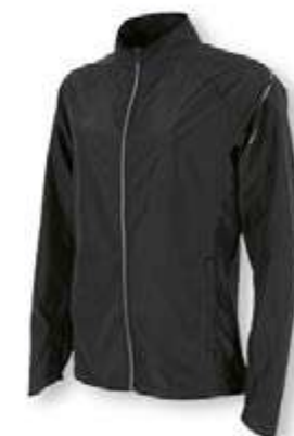
Black 457600 - 8000