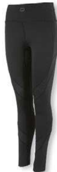
Black 434608 - 8000