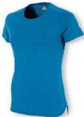
Blue 414600 - 5555