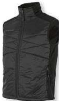
Black 467000 - 8000