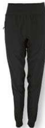
FUNCTIONALS FLEX PANTS LADIES ART. NO. 431601 - 8000