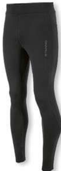
Black 434005 - 8000