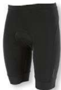
Black 438006 - 8000