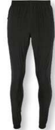
FUNCTIONALS FLEX PANTS ART. NO. 431003 - 8000