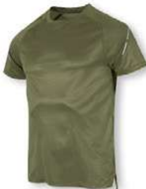
Army Green 414011 - 9911