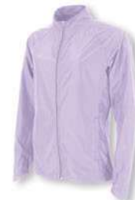
Lila 457600 - 7090