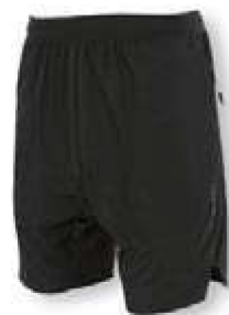
Black 437003 - 8000