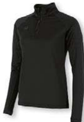
Black - Anthracite 408611 - 8900