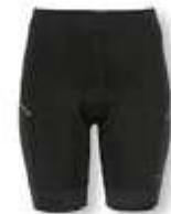
FUNCTIONALS CYCLING SHORTS LADIES ART. NO. 438606 - 8000