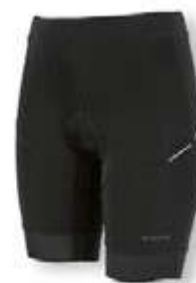
Black 438606 - 8000