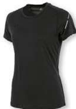
Black 414602 - 8000