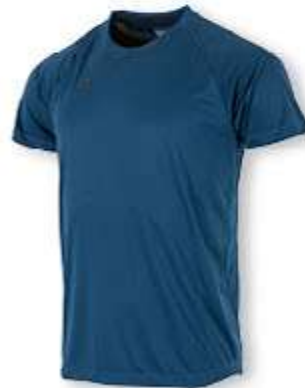
Deep Blue 414015 - 7555