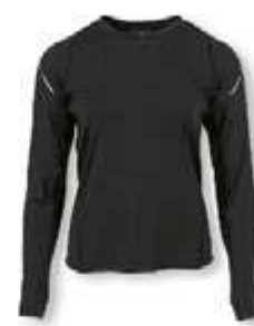
FUNCTIONALS LONG SLEEVE SHIRT LADIES ART. NO. 462601 - 8000