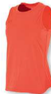
Coral 469604 - 6620