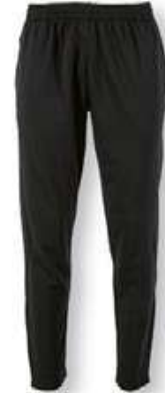
FUNCTIONALS TRAINING PANTS ART. NO. 432004 - 8000