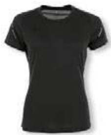
8000 FUNCTIONALS LIGHTWEIGHT SHIRT LADIES ART. NO. 414602