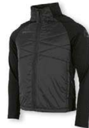
Black 408022 - 8000