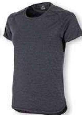
Anthracite 414600 - 9990