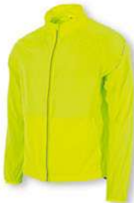
Neon Yellow 457004 - 4004