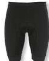
FUNCTIONALS CYCLING SHORTS ART. NO. 438006 - 8000