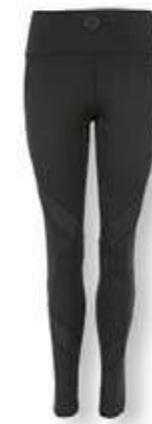
FUNCTIONALS TIGHTS LADIES II ART. NO. 434608 - 8000