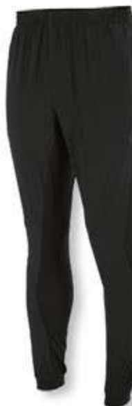
Black 431003 - 8000