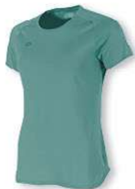
Ocean Green 414600 - 1150