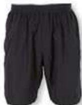
FUNCTIONALS 2-IN-1 SHORTS ART. NO. 422002 - 8000