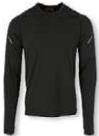
FUNCTIONALS LONG SLEEVE SHIRT ART. NO. 462000 - 8000