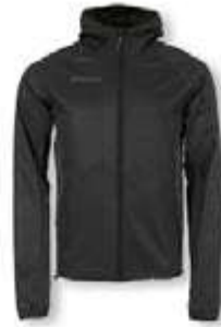
FUNCTIONALS FLEX JACKET ART. NO. 457002 - 8900