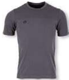
FUNCTIONALS SEAMLESS SHIRT ART. NO. 414013 - 9980