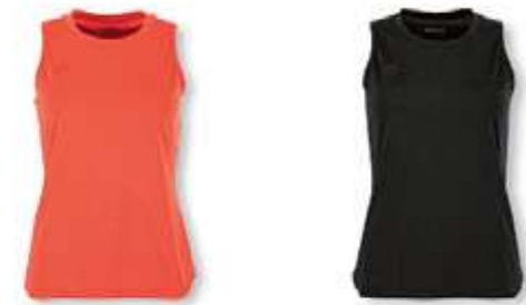
6620 8000 FUNCTIONALS TRAINING TANK TOP LADIES ART. NO. 469604