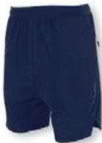
Navy 437003 - 7000