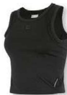
Black 469603 - 8000