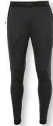
FUNCTIONALS TRAINING PANTS II ART. NO. 432008 - 8000