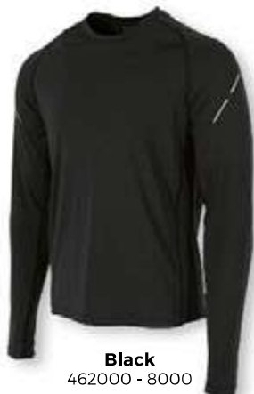
Black 462000 - 8000