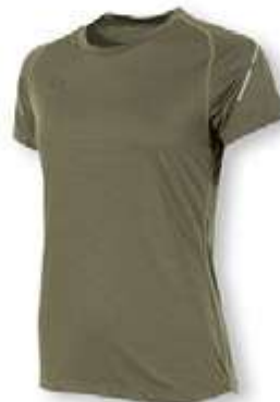
Army Green 414602 - 9911