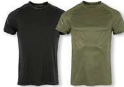
8000 9911 FUNCTIONALS LIGHTWEIGHT SHIRT ART. NO. 414011