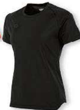
Black 414603 - 8000