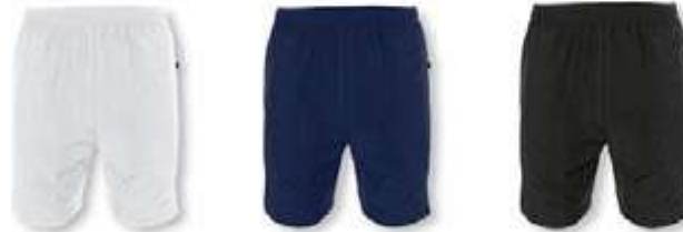
2000 7000 8000 FUNCTIONALS WOVEN SHORTS II ART. NO. 437003