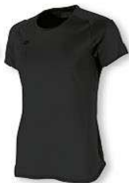
Black 414600 - 8000