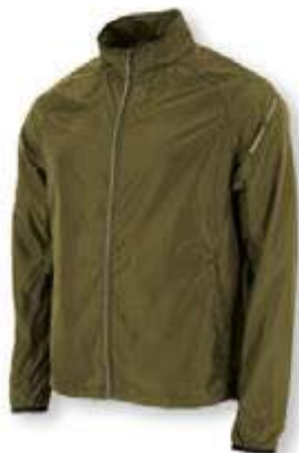
Army Green 457004 - 9911