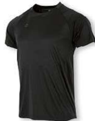
Black 414015 - 8000