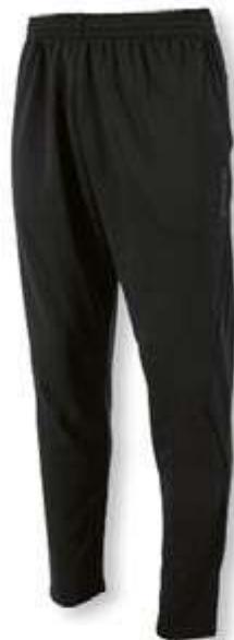
Black 432004 - 8000